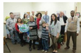
Holiday Open House